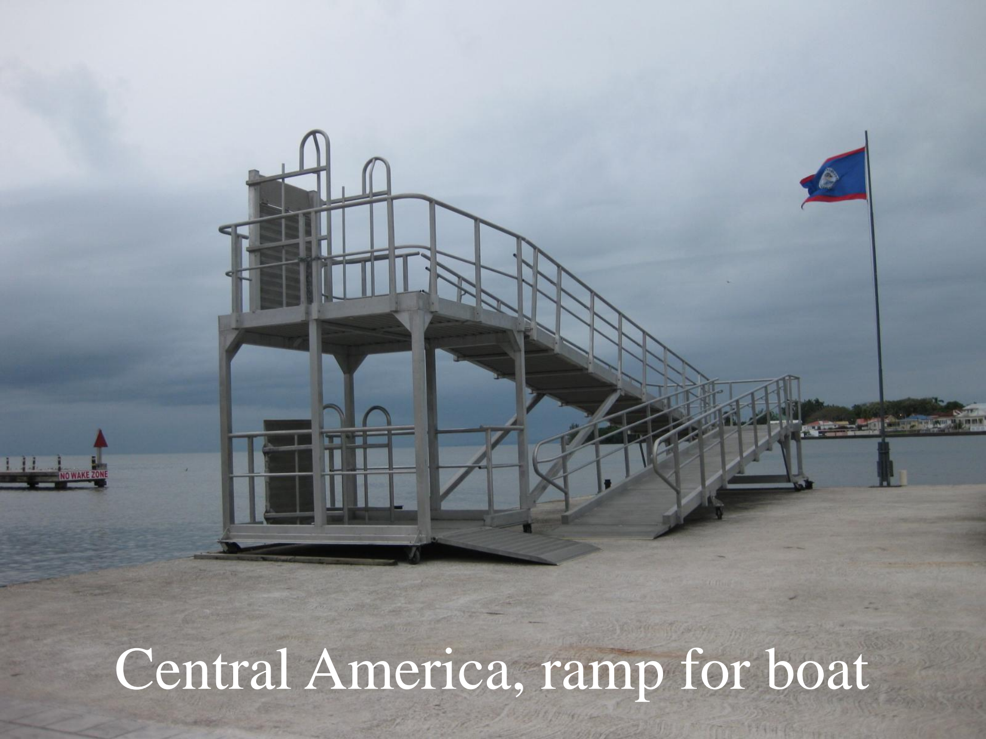
Central America, ramp for boat