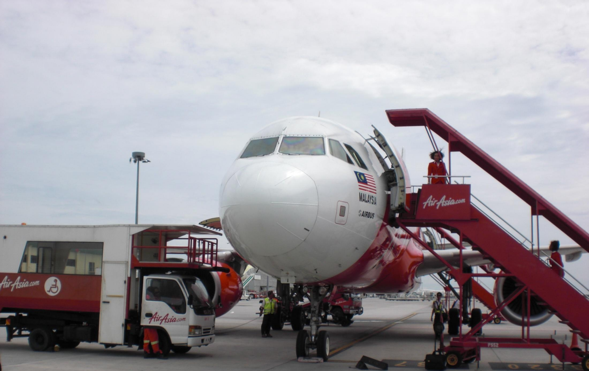
Air Asia, KL Malaysia